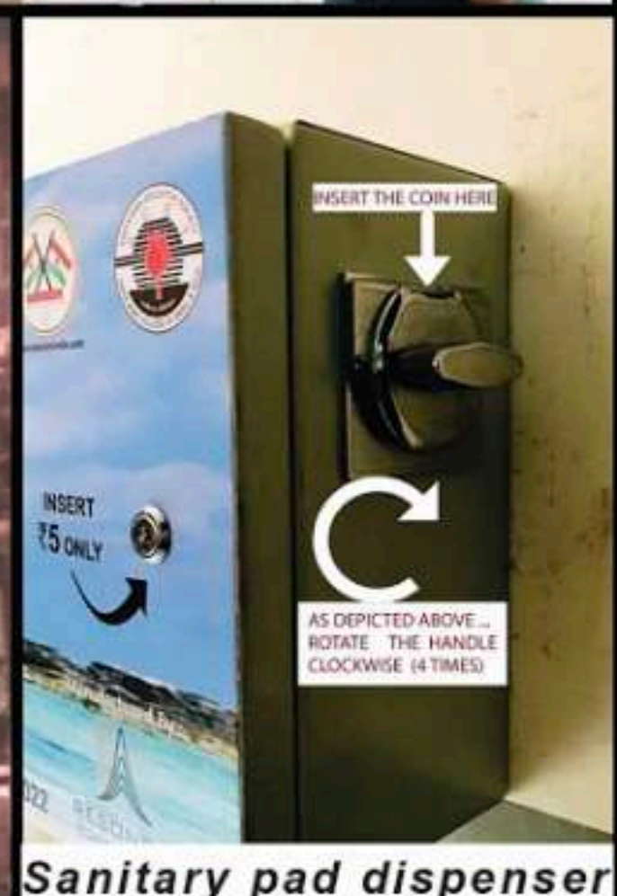
Sanitary pad dispenser installed for students